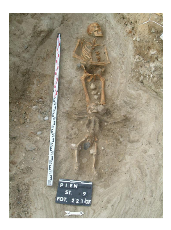
Fig. 2. Pień, Kujawsko-Pomorskie voivodeship, site 9 (cemetery). Grave 59 (in Drozd, Janowski, Poliński, 2010, 99).