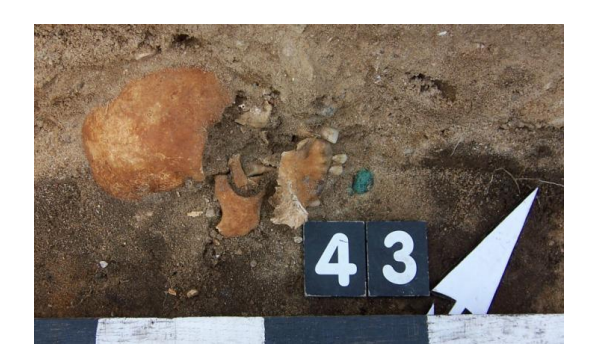
Fig. 6. Pień, Kujawsko-Pomorskie voivodeship, site 9 (cemetery). Coin in situ in grave 30 (Poliński, in print).