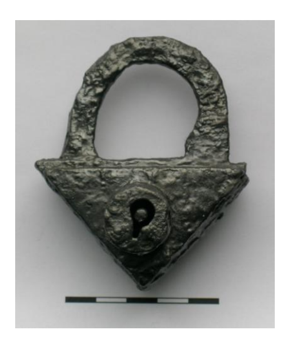
Fig. 4. Pień, Kujawsko-Pomorskie voivodeship, site 9 (cemetery). A padlock from grave 3 (Poliński, in print).