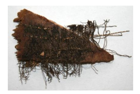
Fig. 3. Pień, Kujawsko-Pomorskie voivodeship, site 9 (cemetery). A piece of a silk fabric from grave 5.